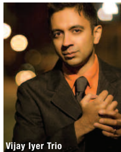
Vijay Iyer Trio