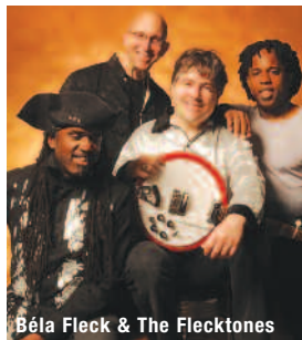
Béla Fleck & The Flecktones