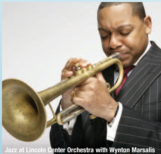
Jazz at Lincoln Center Orchestra with Wynton Marsalis