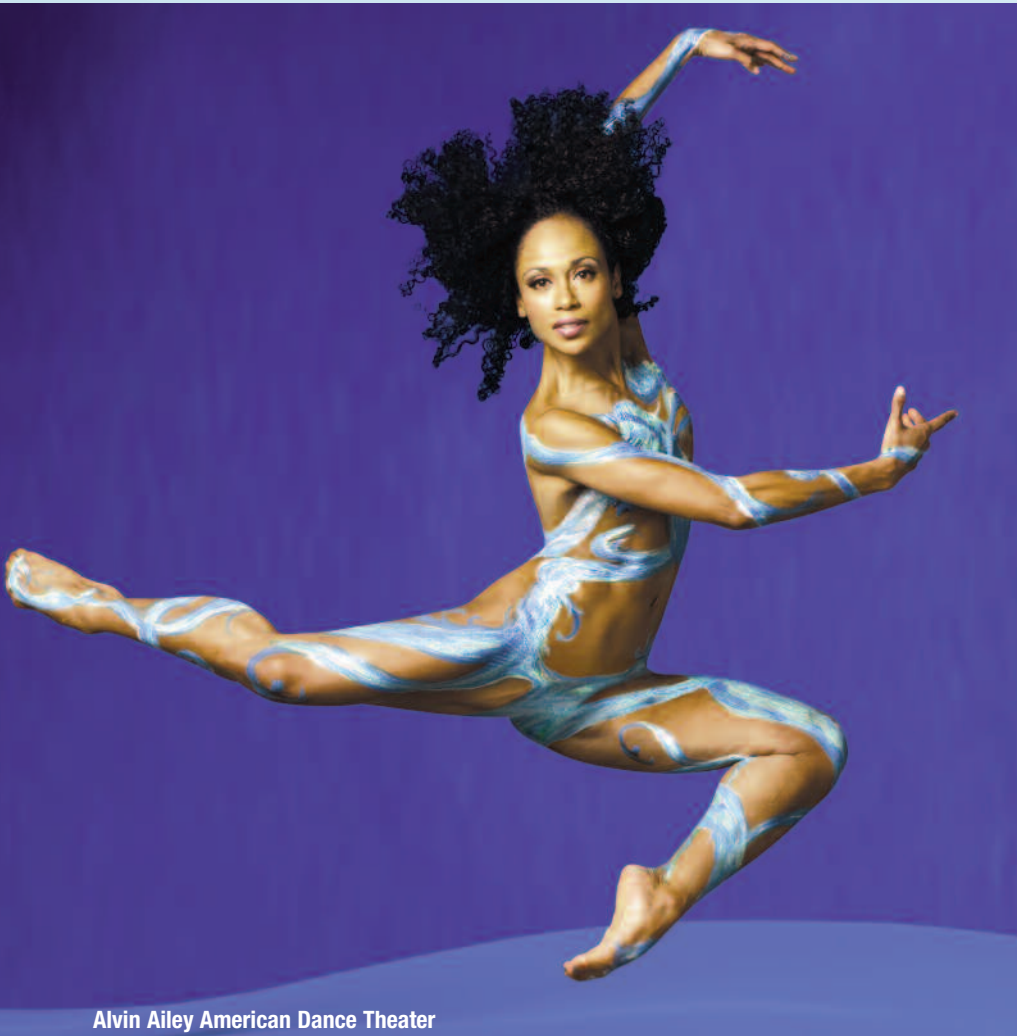
Alvin Ailey American Dance Theater

Celebrity Series of Boston, Inc. 20 Park Plaza, Suite 1032 Boston, MA 02116-4303